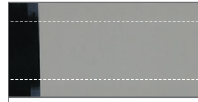
PPG 100% Acrylic Latex Dixie Gray (3-517)

The PPG product withstood 400 cycles without showing any breakthrough of the film. This means better resistance to abrasion so you can walk on your surface with confidence.