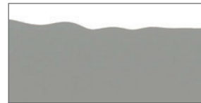
PPG WB Alkyd Dixie Gray (3-617)

The PPG product offers better flow and leveling so brush strokes in corners or around posts or railings will be virtually unnoticeable.