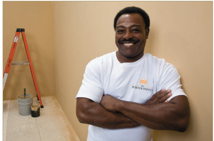
Professional contractors choose Pro-Master 2000 because it offers performance and durability at a great value.